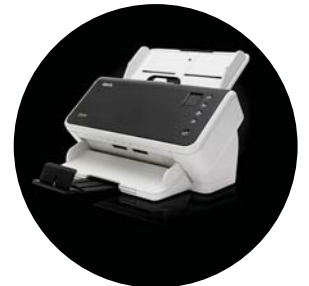
Alaris S2050/S2070 Scanners